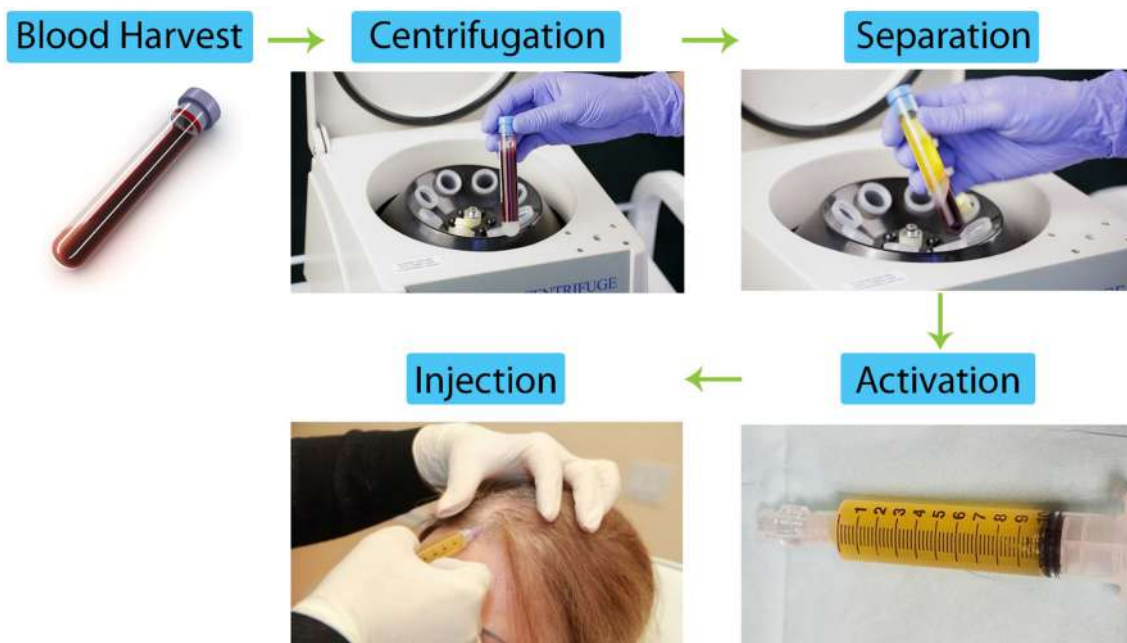
Fig. 1 Schematic illustration of the preparation of platelet-rich plasma (PRP)

In general, to achieve a highly efficient PRP various protocols and procedures have been optimized with respect to different variables of the process, like number of spins, volume and sampling of processed WB, centrifugation time, and range of centrifugal acceleration. So, many optimizations in different steps could improve the final efficacy of concentrated PRP and it is advisable to standardize individual preparation protocols, which are cost-effective and easy to adapt in clinical settings [3, 9]. Here